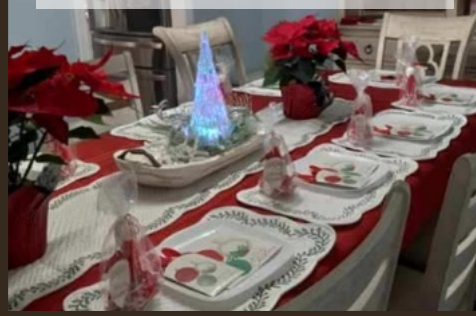
Nine-Hole Ladies' Christmas Dinner!