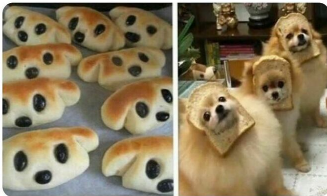
Purebread dogs vs. inbred dogs

Some "just for fun" April celebrations include: National Pillow Fight Day (6th), National Library Worker Day (9th), national siblings day (10th) and World Penguin Day (25th). Educate.today