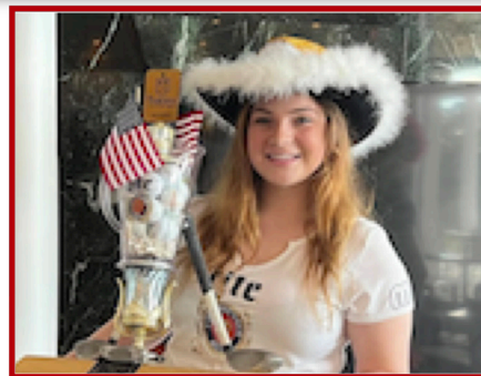
Photos from Men's end-of-season MOM Dinner and Pictionary Night